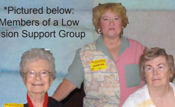
*Pictured below: Members of a Low Vision Support Group

110 individuals received assistive technology training increasing their marketability, productivity and social inclusion.