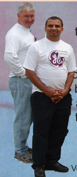
*Pictured left: Volunteers from GE

8,912 volunteer hours were logged by 714 volunteers - including: readers, board members and transportation assistance.